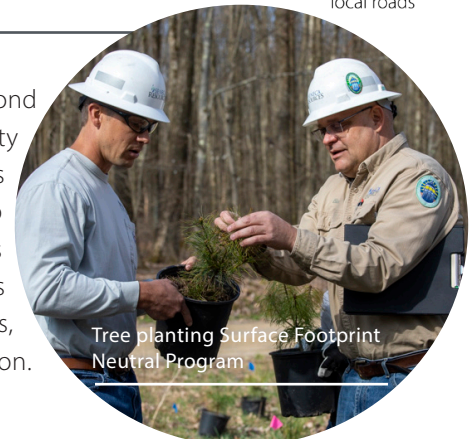
Tree planting Surface Footprint Neutral Program