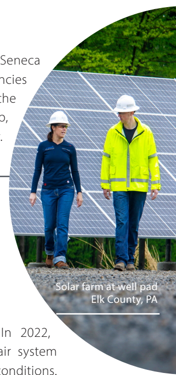
Solar farm at well pad Elk County, PA

Seneca is always looking for new ways to incorporate green technology into its operations. In 2022, we installed a small solar farm at a producing pad in Elk County, PA, to power a compressed air system that runs the pad's pneumatic devices. The pad is 100% solar-powered during optimal conditions.