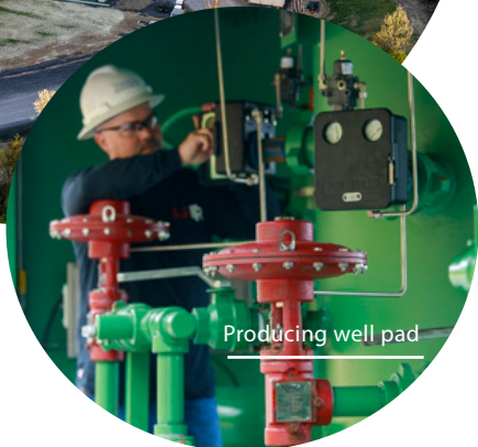
Producing well pad