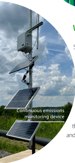
Continuous emissions monitoring device