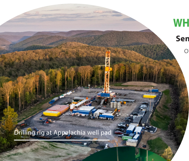
Drilling rig at Appalachia well pad