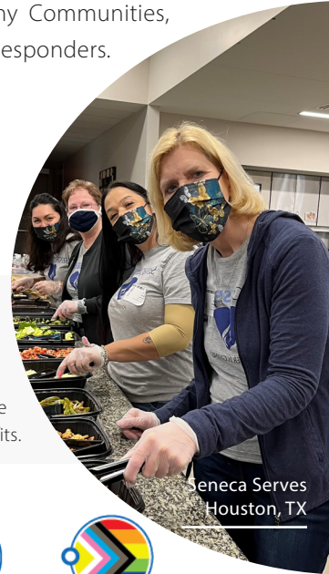
Seneca Serves Houston, TX

Our employee volunteer program, Seneca Serves, encourages employees to give back to the communities in which we live and operate. Employees have donated their time and raised funds for local nonprofits.